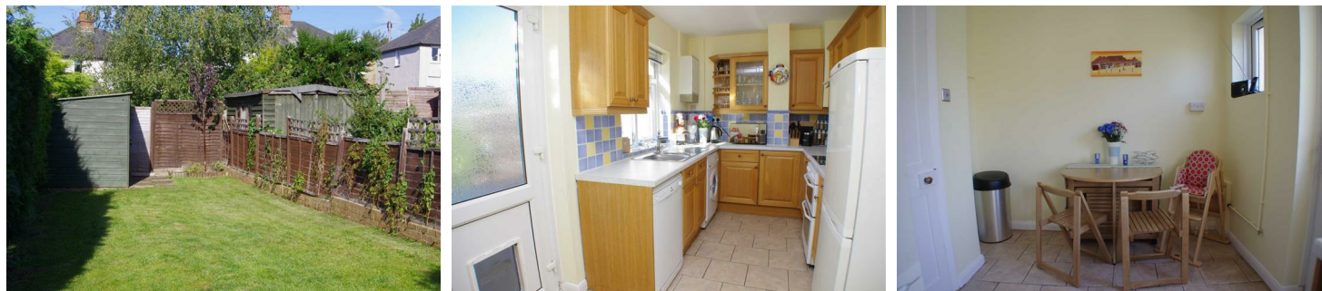
Ground Floor Approx. 35.2 sq. metres (378.4 sq. feet)

Situated within easy access of both the City Centre and mainline train station with direct trains into London St Pancras, this two double bedroom property offers a spacious lounge, a 16ft fitted kitchen with diner, an upstairs bathroom, a driveway for off road parking and a good sized garden.